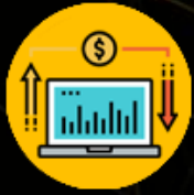
ITEX TRADING TERMINAL