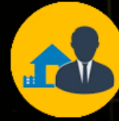
ITEX BROKER HOUSE